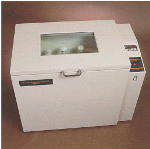
Model C25, closed view.